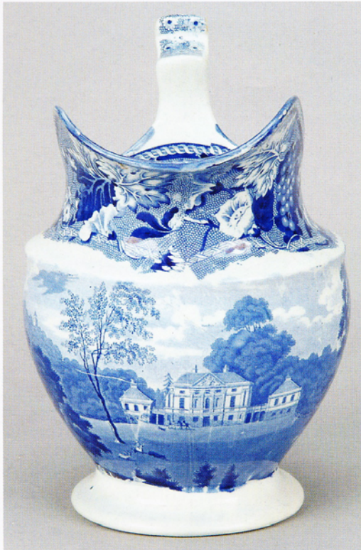
Figure 2. A wash jug with a view of Hare Hall in Essex, made by Enoch Wood & Sons of Burslem. As with many others from the firm's extensive Grapevine Border series, the scene is copied from an engraving in John Preston Neale's Views of the Seats (1818-28).