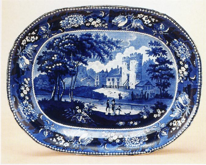
Figure 7. A platter by William Adams of Stoke from a Bluebell Border series of views. This one shows 'Lyme Castle, Kent' copied from a lithograph by Hullmandel after Frederick Calvert (published 1822).