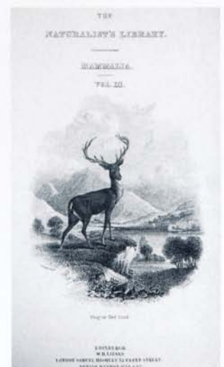
Figure 13. A tea plate from an uncommon Mammalia series by Elijah Jones of Cobridge. This example shows the 'Red Stag', taken from a title page engraving in the Mammalia section of Sir William Jardine's The Naturalists Library (1833-43).