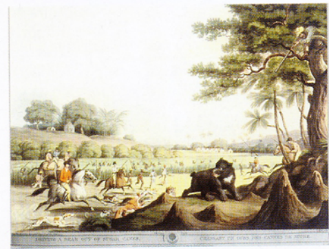
Figure 10. A soup tureen stand from Spode's famous Indian Sporting series depicting 'Driving a Bear out of Sugar Canes'. The scenes are taken from Samuel Howitt's engravings for Captain Thomas Williamson's Oriental Field Sports - Wild Sports of the East (1807).

books of European prints which were also copied by the potters. Another field ripe for further study.