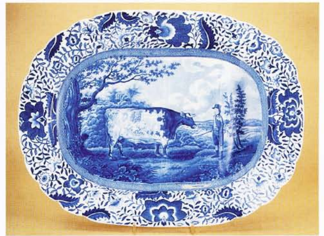
Figure 12. A well-and-tree platter depicting the famous Durham Ox. This particular pattern is very desirable and is copied from a large engraving by J. Whessell after a painting by J. Boulton (published in 1802).