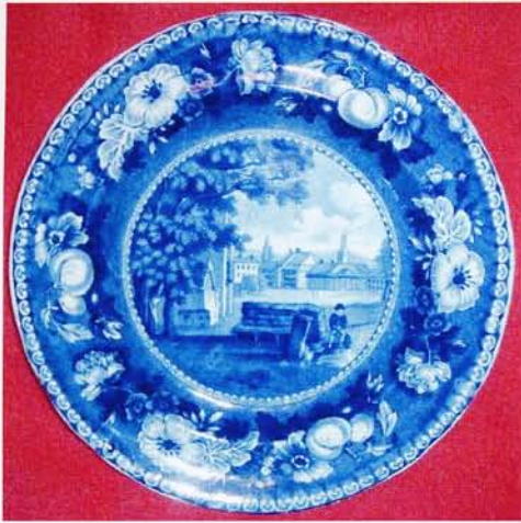
Figure 11. A teaplate by Henshall & Co of Longport with a view titled 'Vevay'. Previously thought to show Vevay in Indiana, it is actually a view of Vevay (now Vevey) in Switzerland, copied from Major James Cockburn's Swiss Scenery (1820).